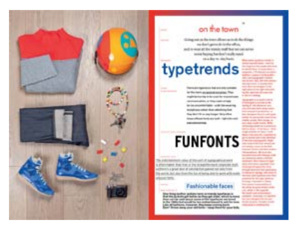
Click to view larger.