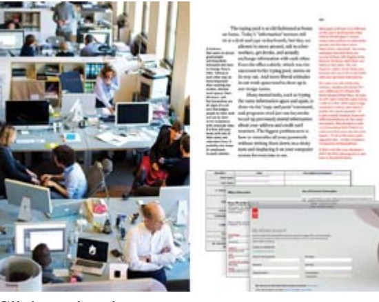
Click to view larger.